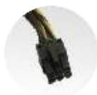
6 pin x 1 PCI-e Connectors