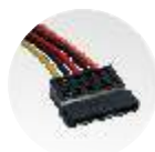
S-ATA x 3 S-ATA Connectors