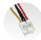
4 pin x 2 Floppy Connectors