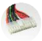
20+4 pin x 1 Motherboard Connector