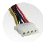
4 pin x 6 Peripheral Connectors