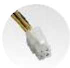
4 pin x 1 CPU+12V Connector